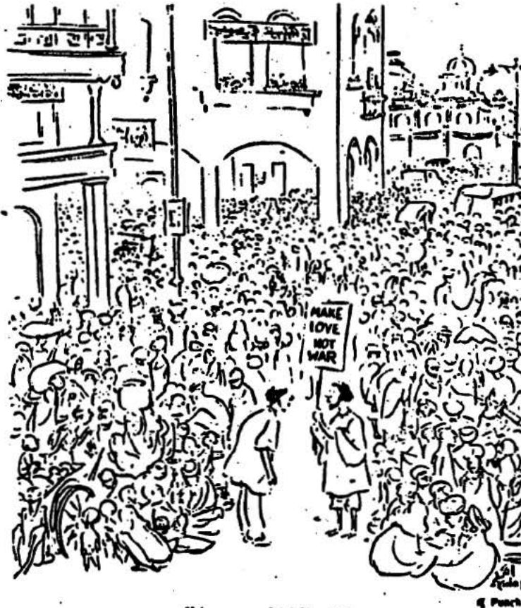
"Are you kidding?"